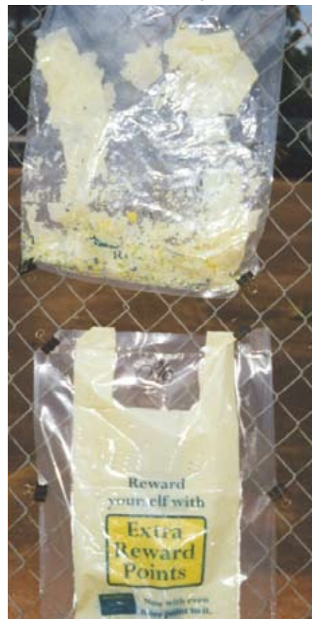
Photo illustration of the thermal degradation of a carrier bag incorporating EPI's TDPA® additive (top row) vs. a bag without EPI's TDPA® additive (bottom row). Test procedures follow ASTM D5272 "Outdoor Exposure Testing of Photo Degradable Plastics" Guidelines.

This product is made possible by EPI's pioneering OXO-BIODEGRADABLE additive technology that has been recognized under the ASTM D 6954-04 guide. Exposure to sunlight or heat triggers a two-step degradation process, in which the plastic breaks down through oxidation into small fragments, which then decompose into the natural elements of carbon dioxide, water, biomass, and minerals.